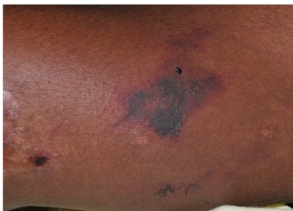
Figure 2 Purpuric patches on extremities.

Her urine toxicology screen was positive for cocaine, and gas chromatography–mass spectrometry (GCMS) was positive for levamisole. Punch biopsy of the skin from involved areas showed leukocytoclastic vasculitis with angiocentric infiltrates of mixed inflammatory cells and small vessel thrombosis with multiple fibrin thrombi in the lumen of the vessels (Figures 3 and 4).