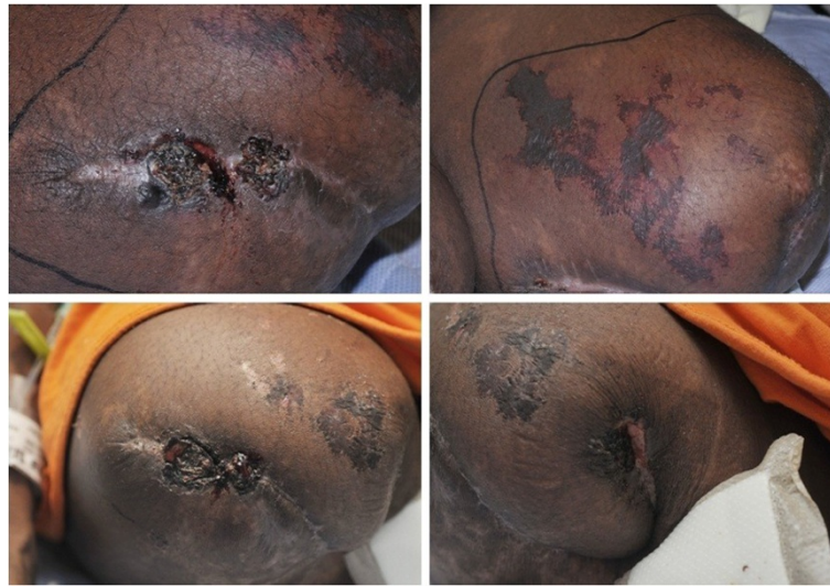
Figure 6 Recurrent purpuric and necrotic lesions on the amputation stumps with repeat use of cocaine.